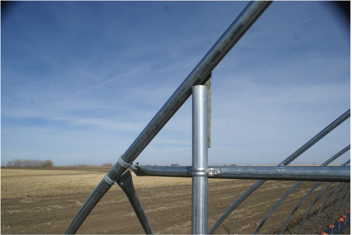
Picture 3: cross brace installed at 45 degrees to make room for the end wall posts