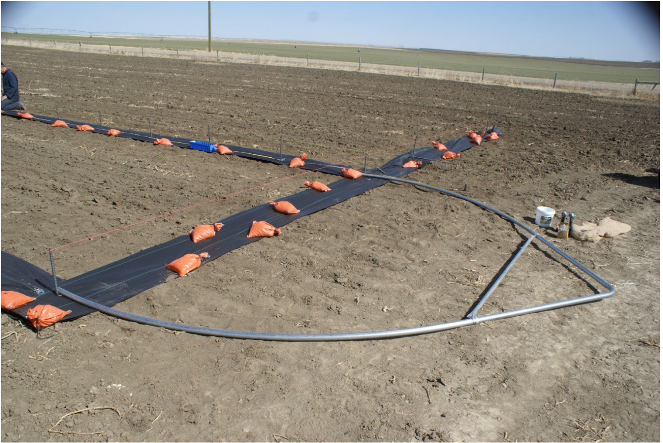
Picture 2: arch being assembled on a flat surface with rebar anchor pins used to measure correct width.