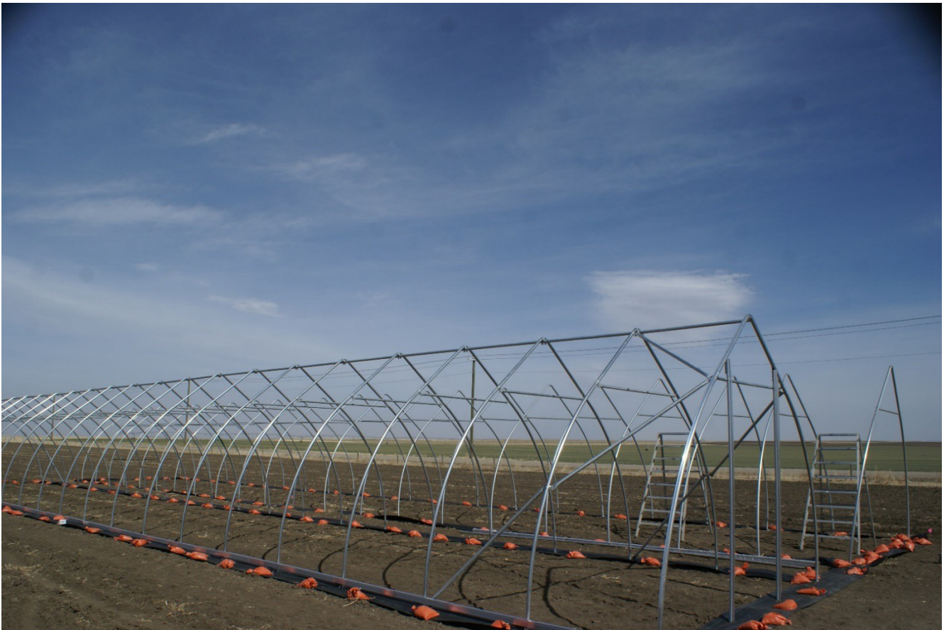
Picture 6: above the wind bracing, the peak brace is installed. This is installed from the last arch to the second last arch

On one corner install the peak brace. The peak brace is installed used brace bands. The peak brace goes from the last arch to the second last arch. Tighten when in place. Put a tek screw through each brace band into the arch to prevent it from moving.