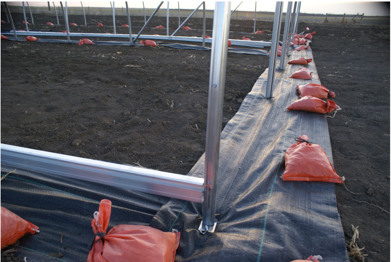
Picture 11: wirelock extrusion installed on the end gable, starting 9" up. Also shown here is the horizontal aluminum wirelock extrusion, but this is not part of the standard tunnel package

The wirelock extrusions are installed using small tek screws. Use a small tek screw at each end and then every 12". Start the extrusion 9" up from the bottom of the arch. The wirelock extrusion is flexed into position as it is screwed into place. Work from one side up the arch, over the top, and then down to the other side. Keep the end 9" up from the bottom of the arch.