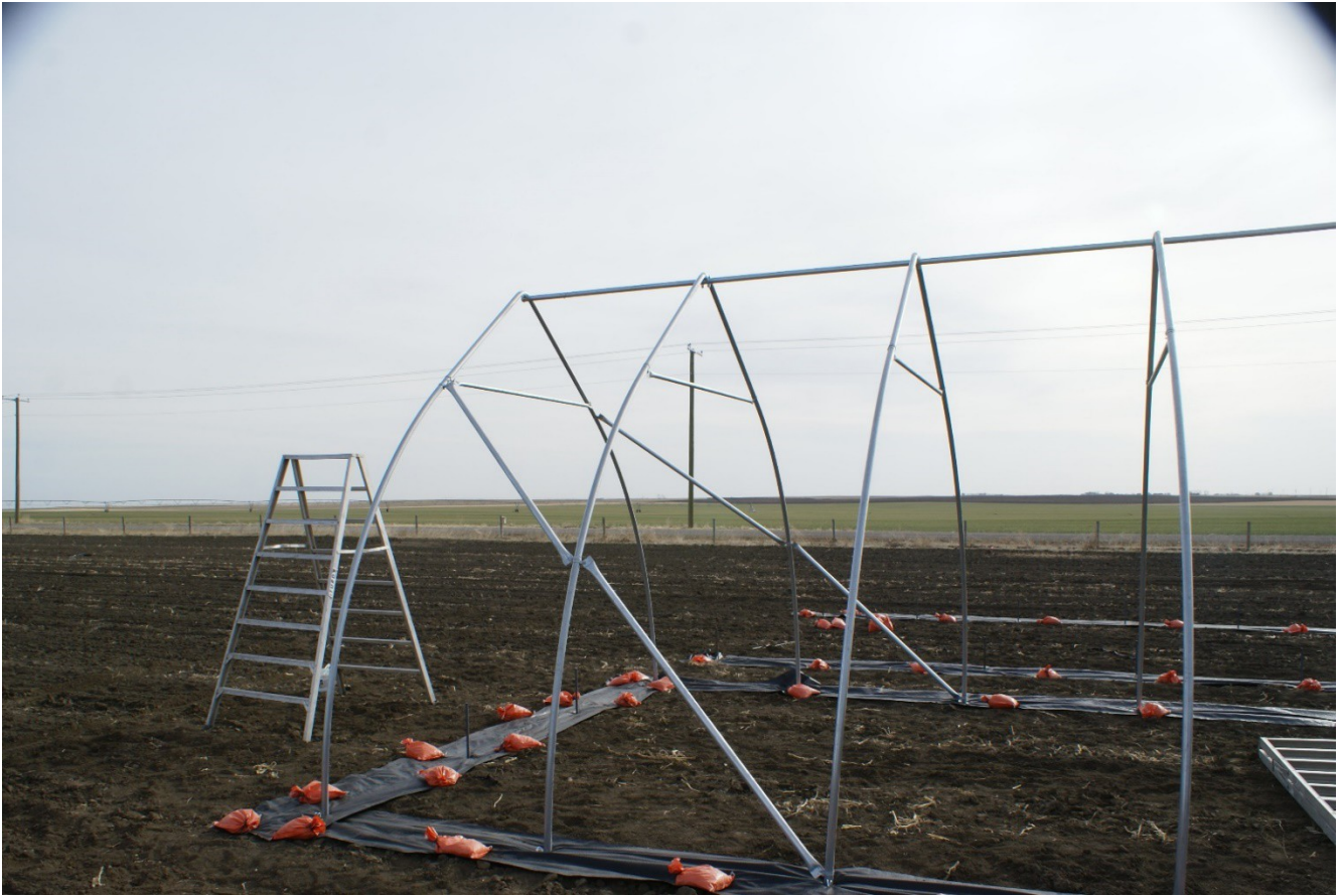
Picture 5: wind bracing installed on the back, which looks the same on the front