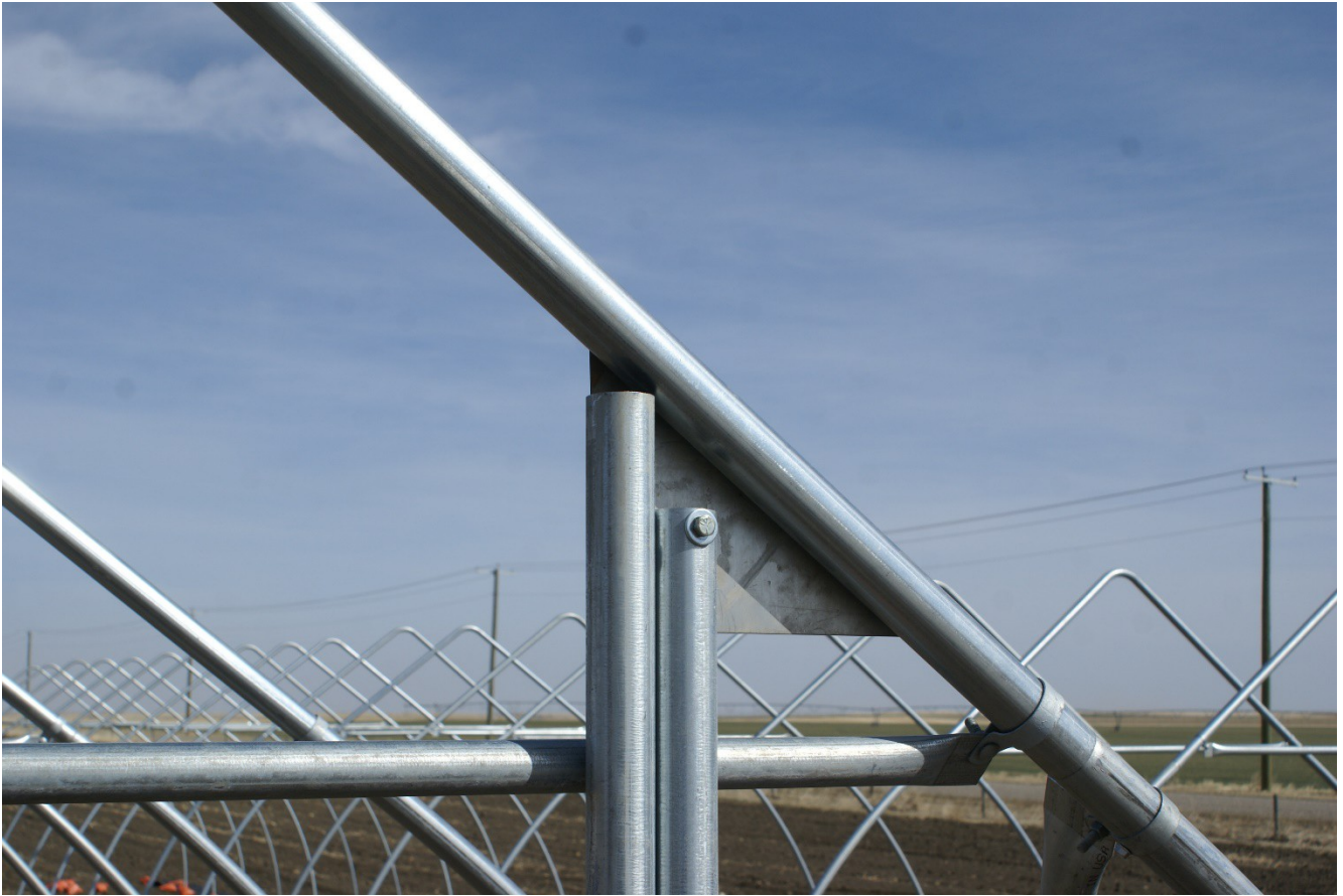
Picture 9: the end wall angle plate is used on the corner where the door is to be installed. The door can be installed in any corner of the tunnel