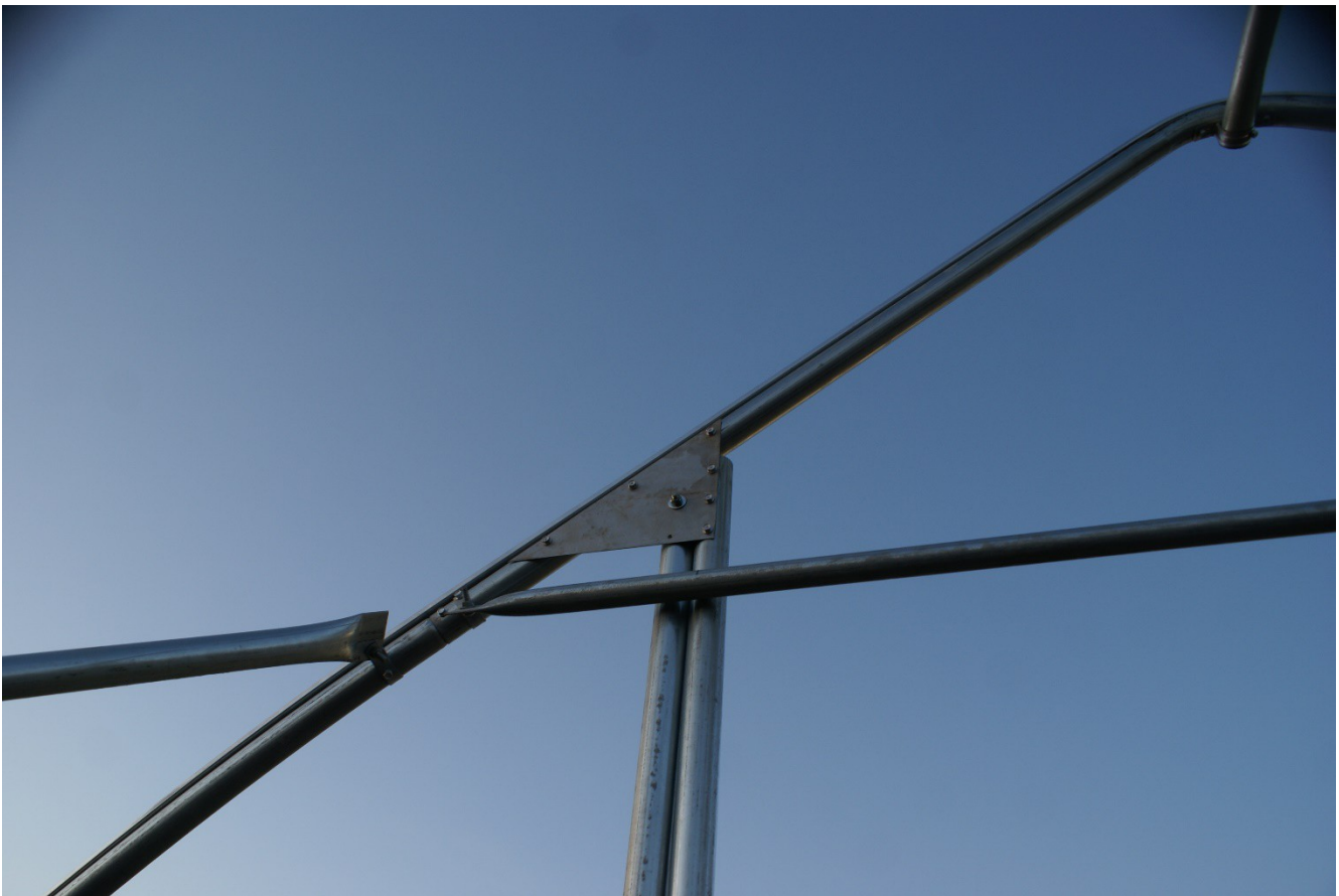
Picture 10: washer and nuts showing on this interior side of the end wall angle plate

The door post is installed with the 5/16" bolt through the end wall angle plate. Let the post hang and then snug up the nut, but do not go too tight, as the door should swing freely. Finally, put on the second nut and tighten them together. Tightening the two nuts together will prevent them from coming off when the door is used repeatedly.