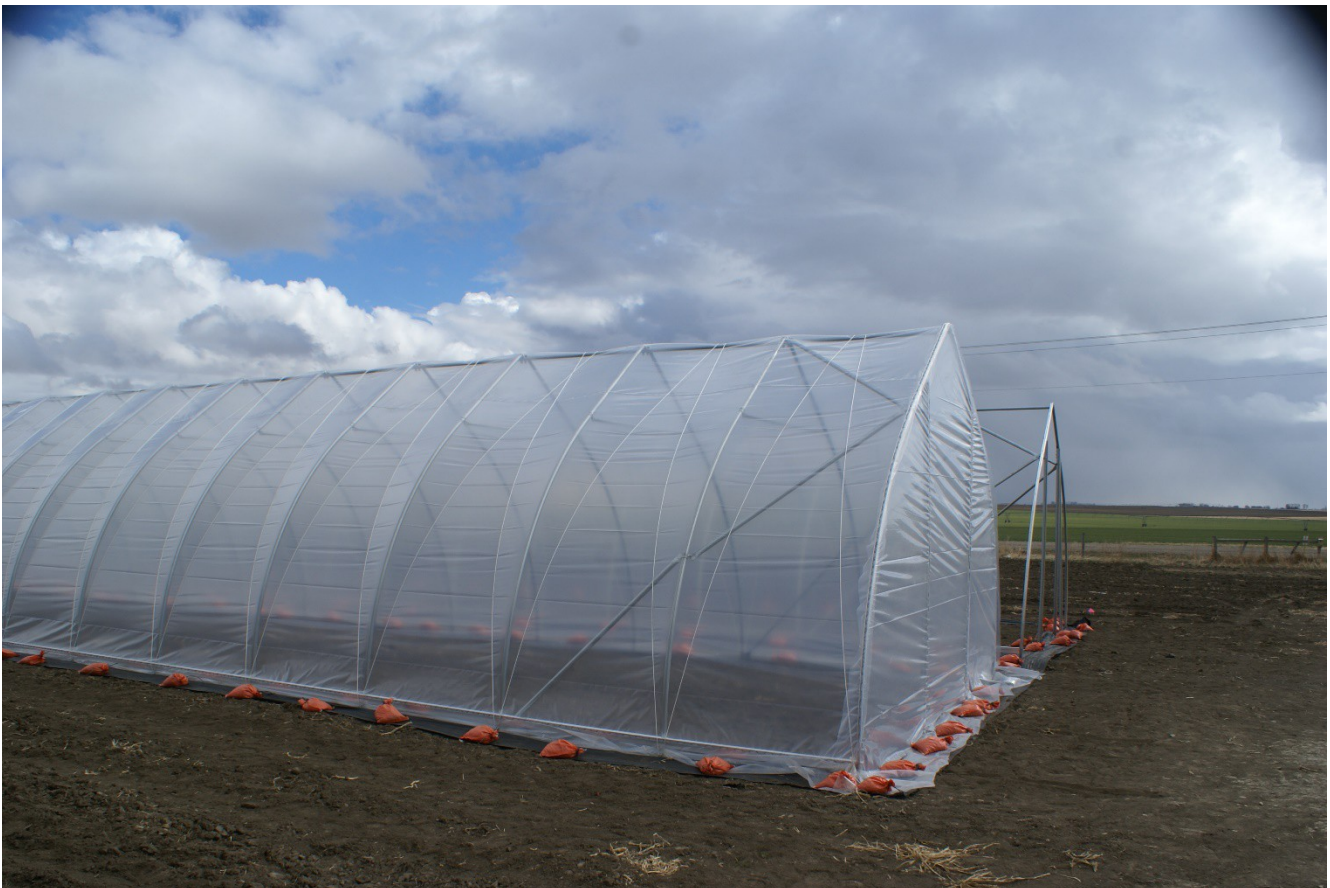
Picture 13: poly on the end walls and the main structure of the tunnel. Sandbags are used to secure the excess plastic on the bottom

Roll the poly out along the tunnel. Start at one end and use a ladder to take one corner up and over the tunnel arches. Work the poly over the tunnel in this way. Once the poly is all the way over the tunnel, centered as best as possible. Secure the poly by installing one or two wirelocks at the top of one of the end wall gables. Then go over to the opposite gable and pull the poly snug. Before installing one or two wirelocks on this end, ensure the poly is centered as best as possible. If the poly is centered and snug, the rest of the wirelocks can be installed down the arches. It is a good idea to have an extra set of hands pulling the poly tight as the wirelocks are being installed. Once all the wirelock is installed, the tunnel is ready for rope.