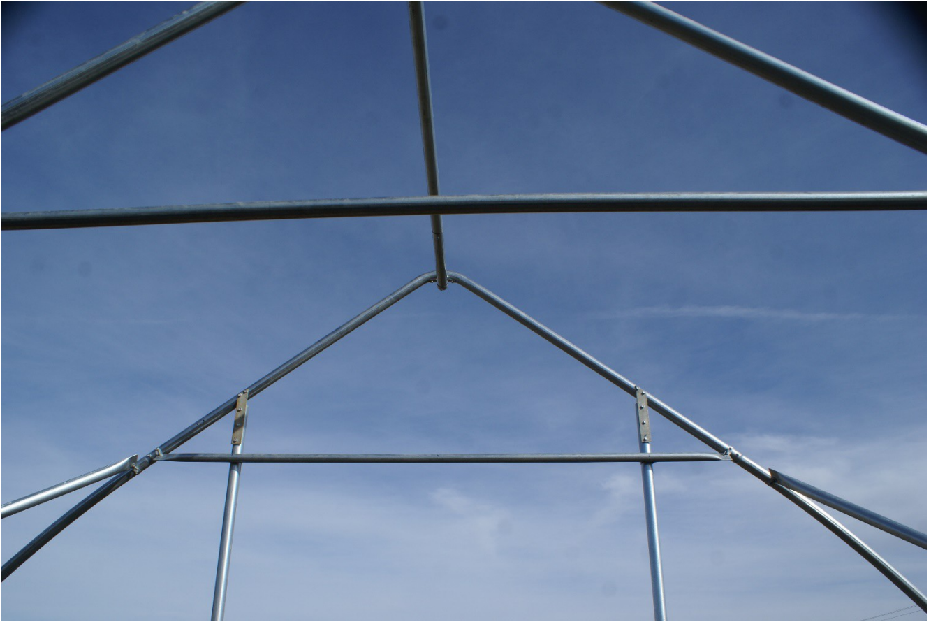
Picture 7: end wall plates are used to connect the vertical end wall posts to the end arch