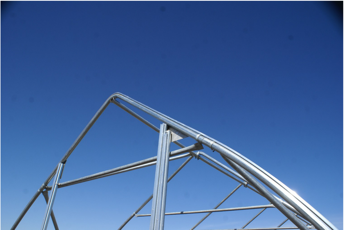
Picture 12: wirelock extrusion installed on the end gable, end wall posts, and the door post

Starting at the top of the end wall post, the wirelock extrusion can be installed to the bottom of the post. Use a small tek screw at each end and then every 12". On the door post, the extrusion from just below the hinge bolt at the top to flush with the bottom.